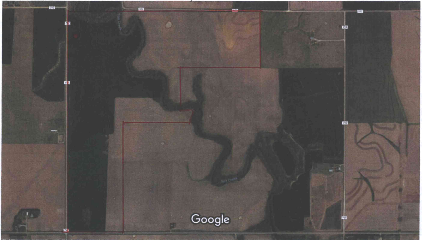
1000 ft

FSA 93A North Creek 154.5A South Creek 247.5 Total Acres