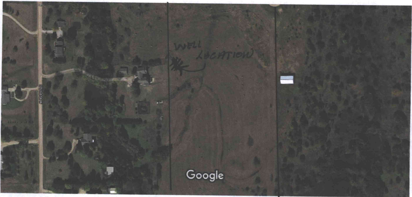
100 ft